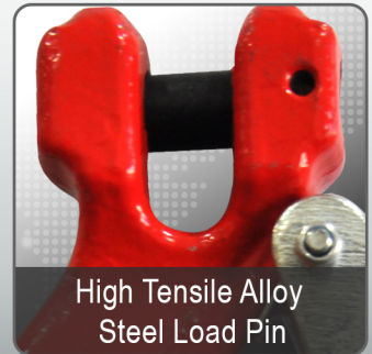
High Tensile Alloy Steel Load Pin