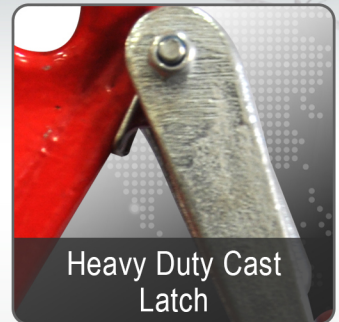
Heavy Duty Cast Latch