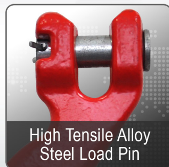
High Tensile Alloy Steel Load Pin