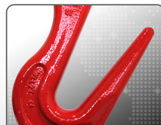
Deep straight throat