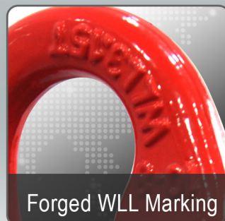
Forged WLL Marking